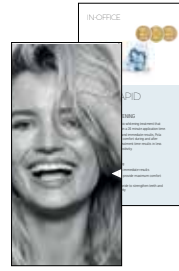
POLA PATIENT HANDOUTS Reorder M100283