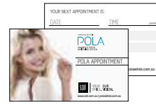
POLA APPOINTMENT CARDS Reorder M100287