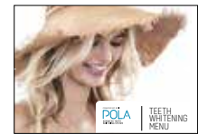
POLA MENU Reorder M100292