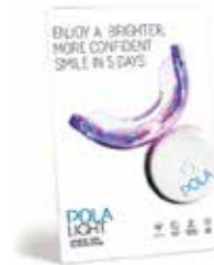
POLA LIGHT STAND Reorder M100505