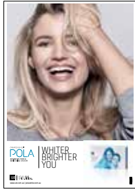
POSTER POLA NIGHT Reorder M100275