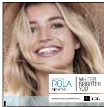
POLA CEILING TILE Reorder M100293