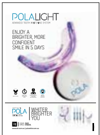
POSTER POLA LIGHT Reorder M100504