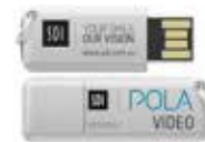
POLA WAITING ROOM USB VIDEO Reorder M100245