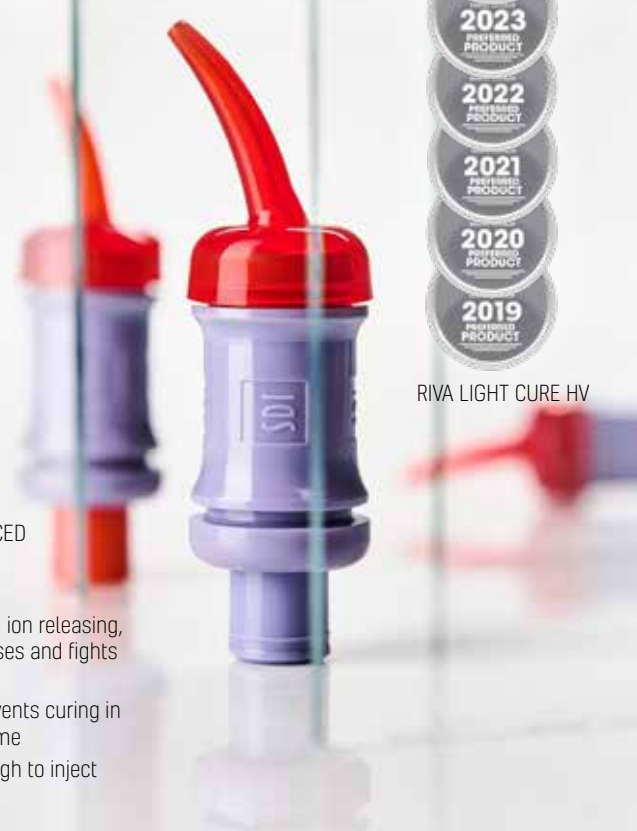
RIVA LIGHT CURE HV

[Source: Thuy et al. Arch Oral Biol. 2008 Nov; 53(11):1017-22]