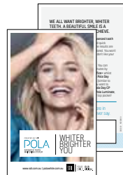
POLA STATEMENT STUFFER Reorder M100291