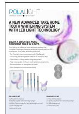
POLA LIGHT DENTIST HANDOUT Reorder M100507