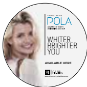
POLA WINDOW STICKER Reorder M100289