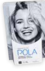
POLA PATIENT H ANDOUT STAND Reorder M100290