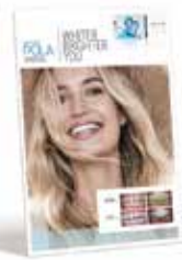
POLA BEFORE & AFTER STAND Reorder M100288