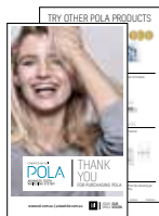
POLA THANK YOU CARD Reorder M100295