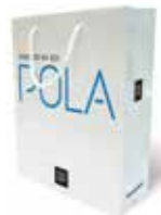
POLA CARRY BAG Reorder M100143