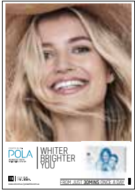
POSTER POLA DAY Reorder M100274

Marketing materials to assist in promoting whitening to patients.